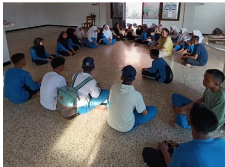
Figure 3. Group Discussion in the Theater Extracurricular Program at Al-Amal Islamic Junior High School

In addition to role-play, group discussions play a central role in fostering a deep understanding of the characters and scripts performed. These discussions serve as interactive spaces where students negotiate meaning, share interpretations, and construct a collective understanding of the characters' motivations and backgrounds. Rather than merely memorizing dialogues, students strive to comprehend the social, emotional, and psychological contexts underlying each character. This reflects the view of Johnson and Johnson (1999), who assert that cooperative learning creates a dialogic space in which students learn to “engage in promotive interaction, where they explain, argue, elaborate, and link new knowledge with prior learning” (p. 24). Through this approach, theater learning extends beyond the technical aspects of acting, it becomes a medium for cultivating critical, reflective, and communicative thinking skills.