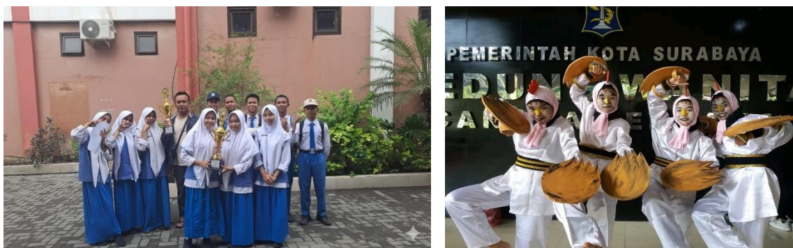
Figure 5 & 6. Student Art Performance Festival

remarkable is that Al-Amal students not only internalize values of teamwork, discipline, and courage during practice but also demonstrate tangible achievements externally. Through cooperative learning, several student theater groups from this school have won first place at the city level and second place at the East Java provincial Student Arts Festival competition. These achievements confirm that the approach is effective not only pedagogically but also in producing real artistic excellence. Ultimately, this success serves as evidence that collaboration-based learning does more than create good performances, it builds strong character, creativity, and competitiveness among students.