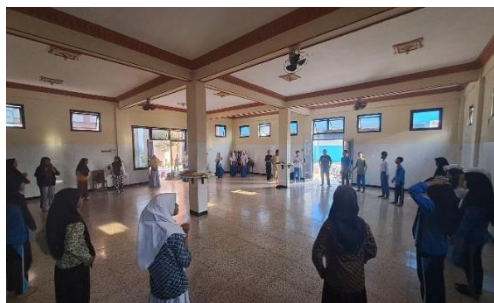
Figure 2. Theatrical role-play in the theater extracurricular program at Al-Amal Islamic Junior High School.

The theater learning strategy based on cooperative learning at Al-Amal Islamic Junior High School is actualized through structured and continuous collaborative activities. The training process is not directed toward individual performance alone but rather emphasizes group work as the core of acting education. Group-based role-play activities form the heart of this learning approach, where students collectively strive to bring a scene to life. Positive interdependence is highly evident in this practice, as the success of a scene cannot be achieved if only one or two students perform well; it requires the engagement, focus, and harmony of every group member. This principle aligns with the idea of Aka (2016), who states that "success is only achievable when all group members learn the objective, creating a dynamic where students are motivated to ensure their peers' understanding alongside their own" (p. 3). Thus, each student feels responsible not only for their own success but also for the collective achievement of the group.