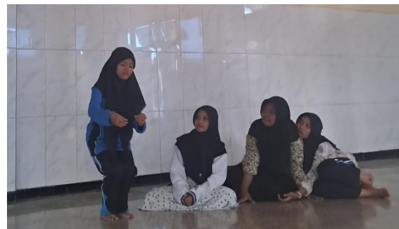
Figure 4 & 5. Role Distribution within Groups